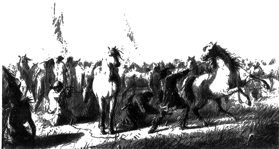
Picketing Horses , painting by Alfred Jacob Miller. Here two Euro-American traders stake horses they have chosen from the Indians' herd behind them. By reducing the carrying capacity for bison on the Great Plains and stimulating Indian/Euro-American trade, horses were a critical element in nineteenth-century Plains ecology.