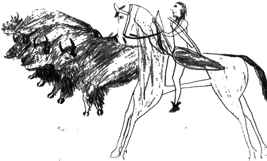
Kiowa Buffalo Hunter , by unknown Indian artist after 1875, on reservation ledger paper.

By the nineteenth century, many Plains Indians had come to define themselves as bison predators, a dependency that was beginning to fail them by 1850.